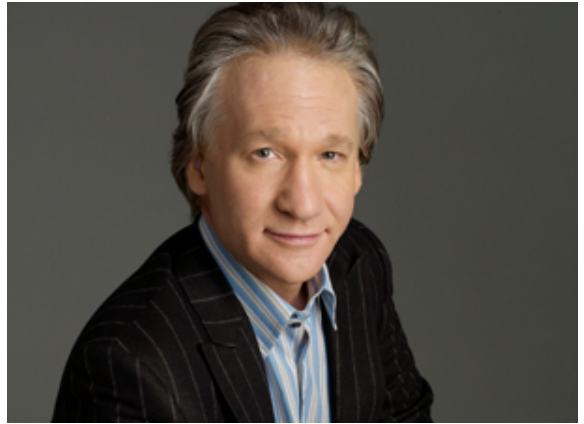
Comedian Bill Maher

Remember a couple of years ago when California was virtually bankrupt? An “economic basket case,” we were told. “Unmanageable.” “A failed state.” They raised taxes on the wealthy. A lot, he says. “And our economy is booming.” He adds that “we just passed France and India to become ... the world’s sixth largest economy.”